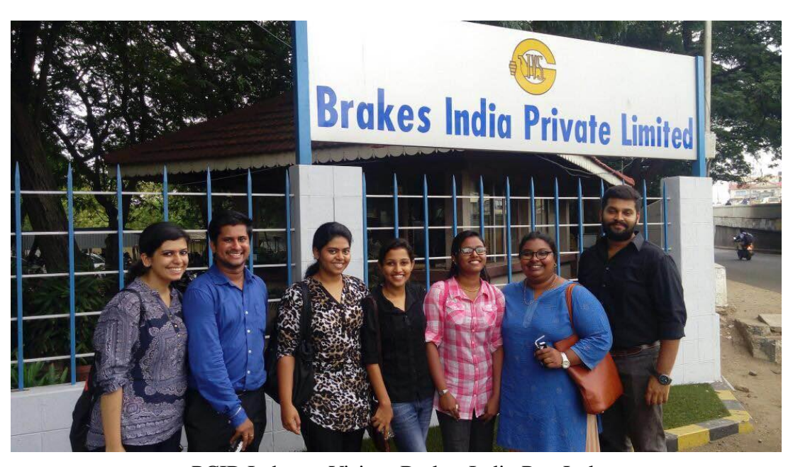
PCIB Industry Visit to Brakes India Pvt. Ltd.