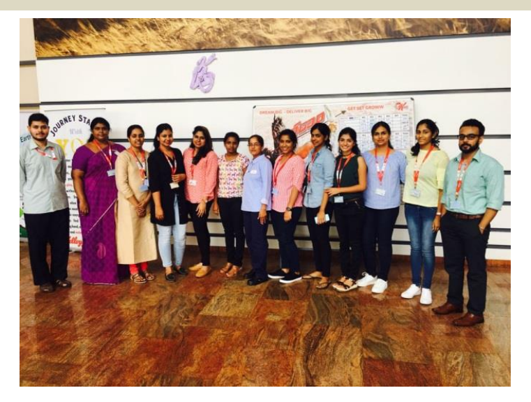
PCIB Industry Visit to Kellogg