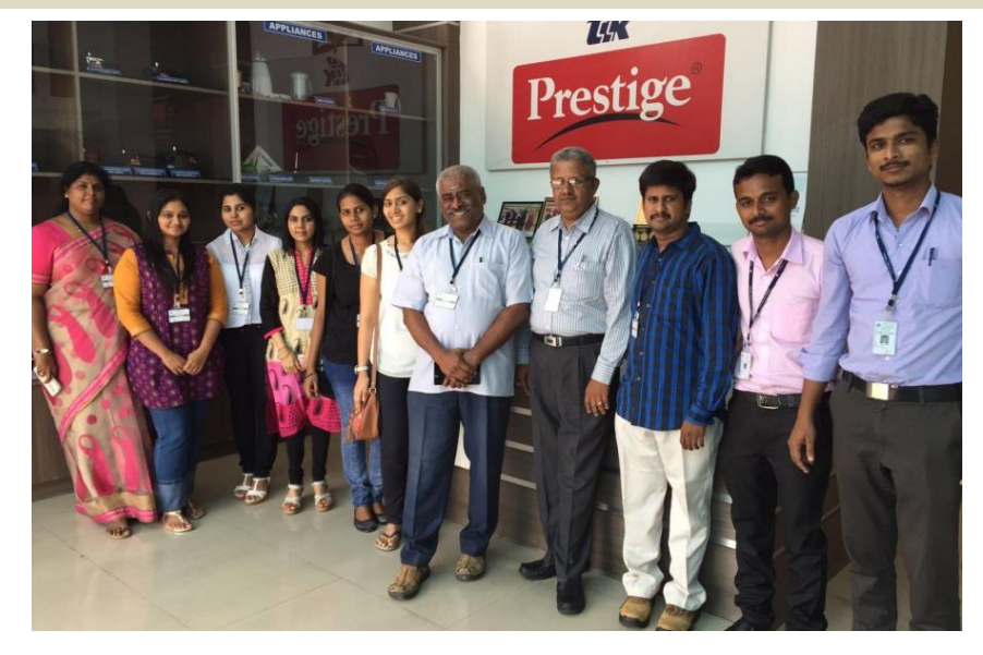
PCIB Industry Visit