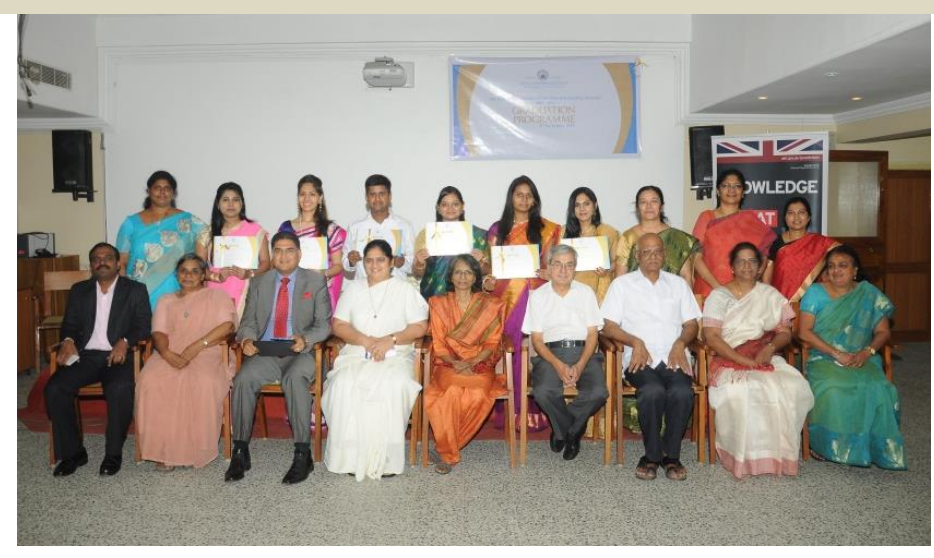
IMBA CLASS 2015