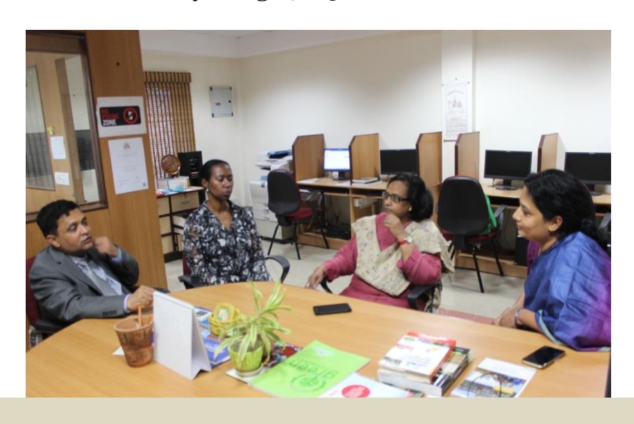
Visits by the LHU Staff & Students 2015 – 2016