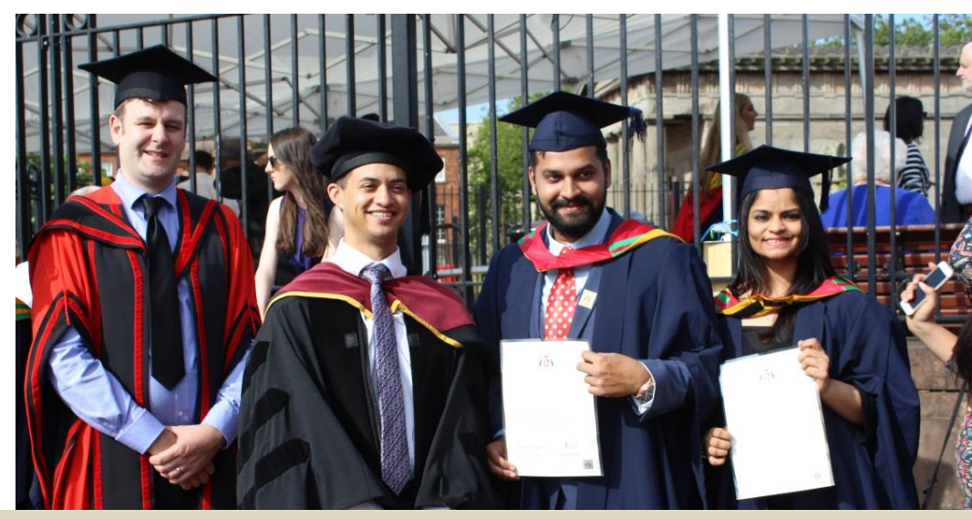
Graduation at Liverpool Hope University, UK