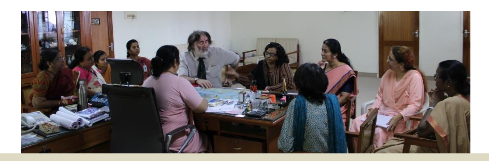
Meeting with the IMBA Committee