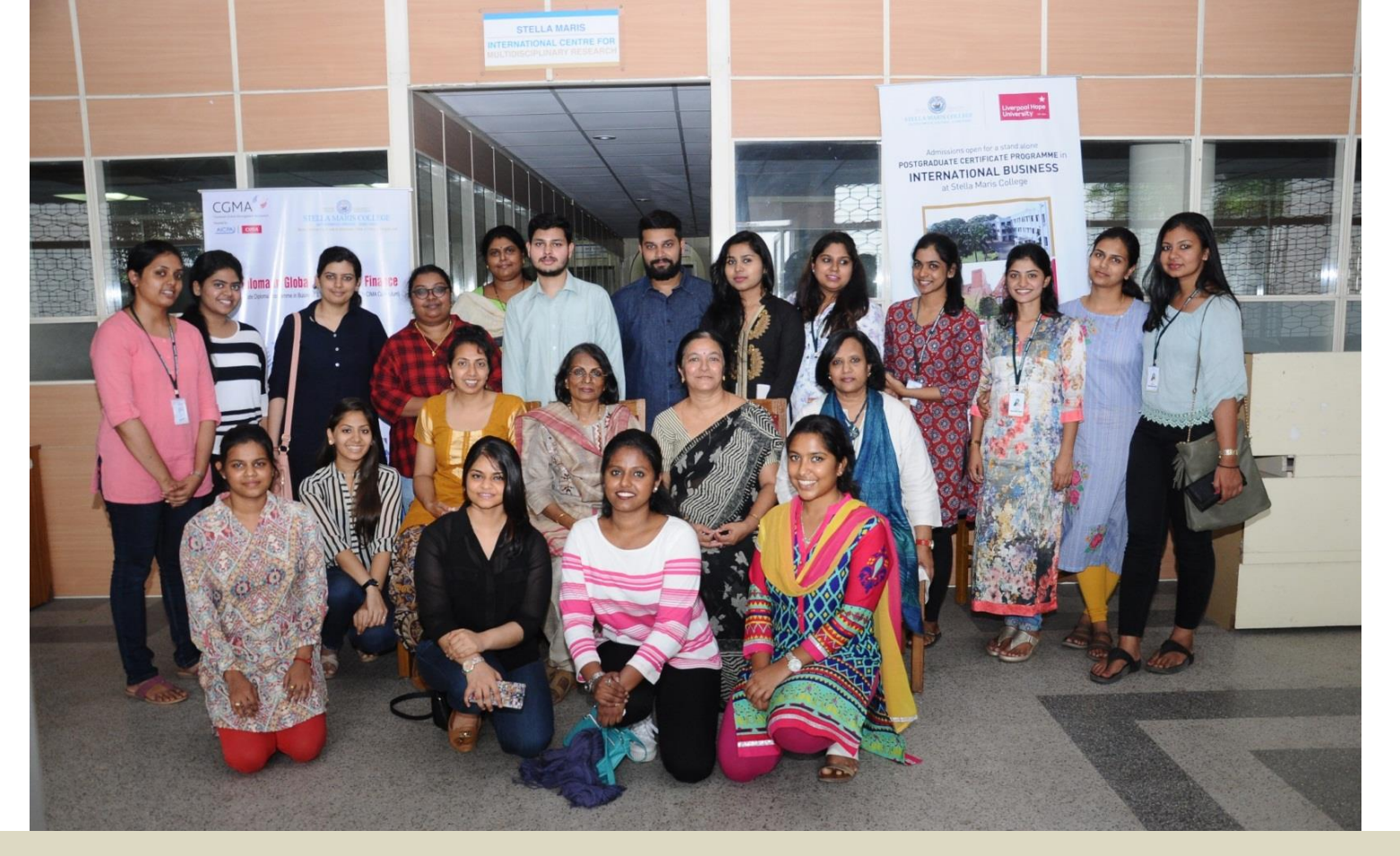
Lunch Get Together with PCIB 2015, 2016, 2017 Batches