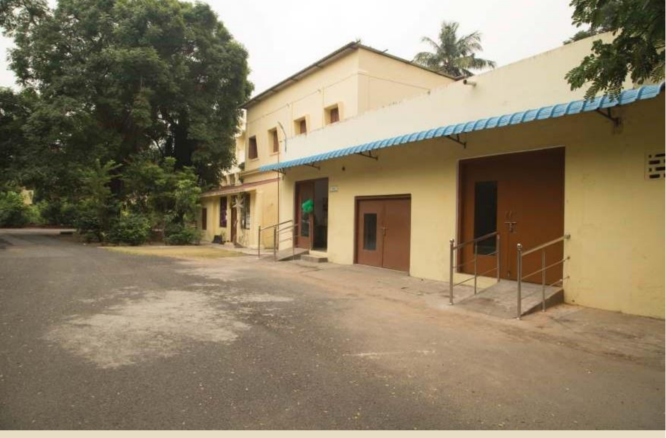
Ramp Facility at Games Room