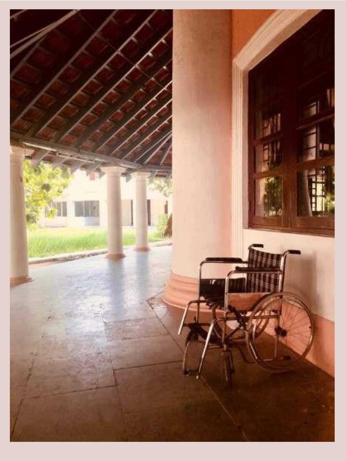
Wheelchair for Special Students at B Block