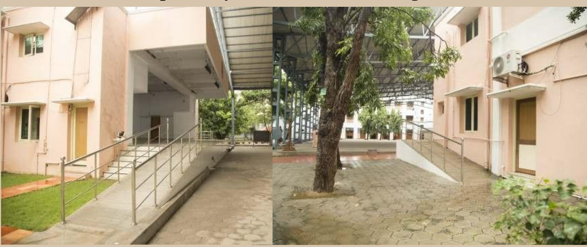
Ramp Facility for Access to OAT Stage