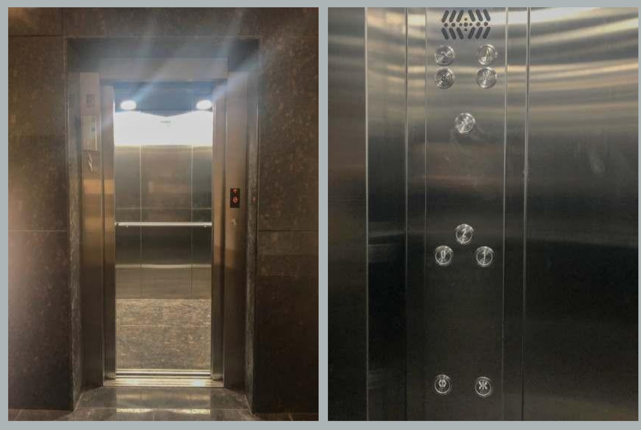
Elevator Facility with Braille Buttons at Snehalaya Hostel