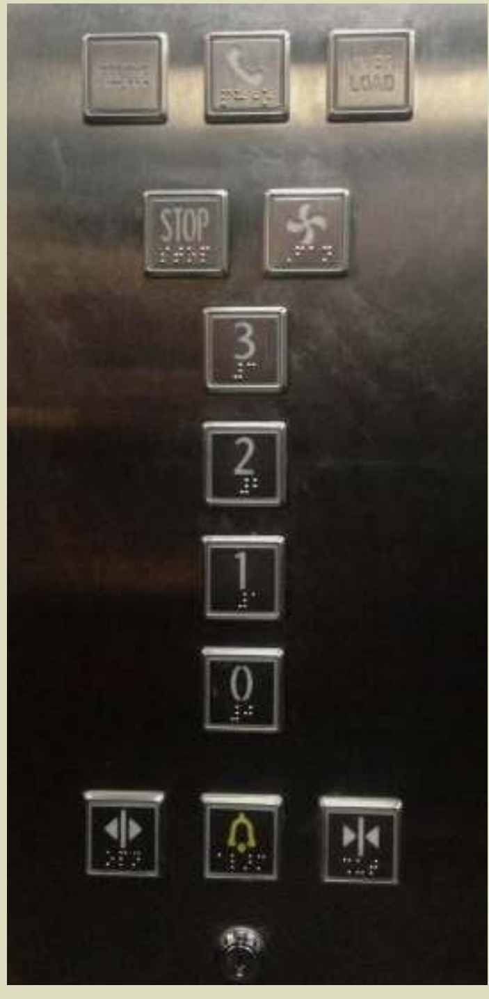
Elevator Facility with Braille Buttons at St. Clare Centre