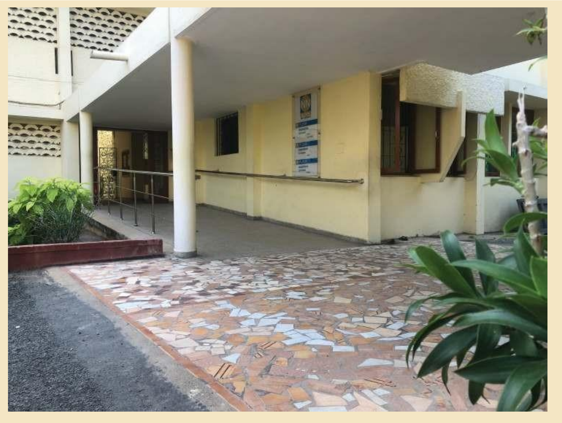
Ramp Facility at Nava Nirmana Block