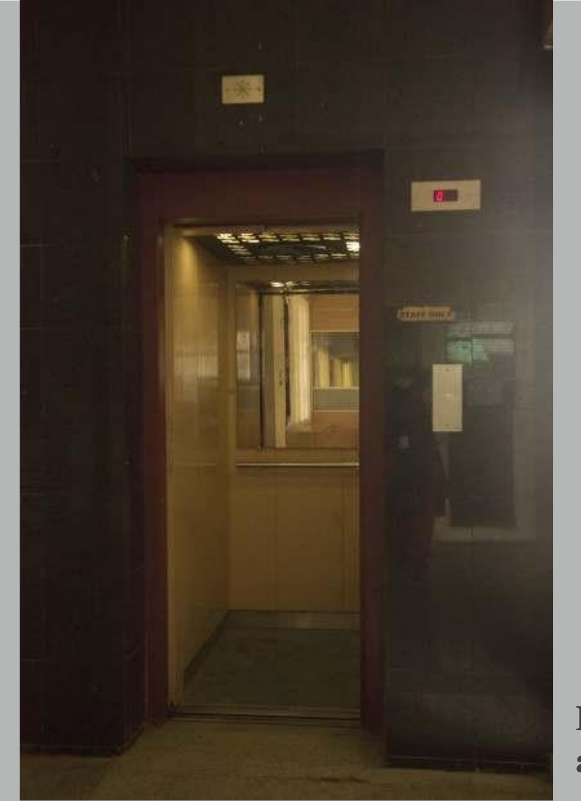
Elevator Facility at St. Francis Block