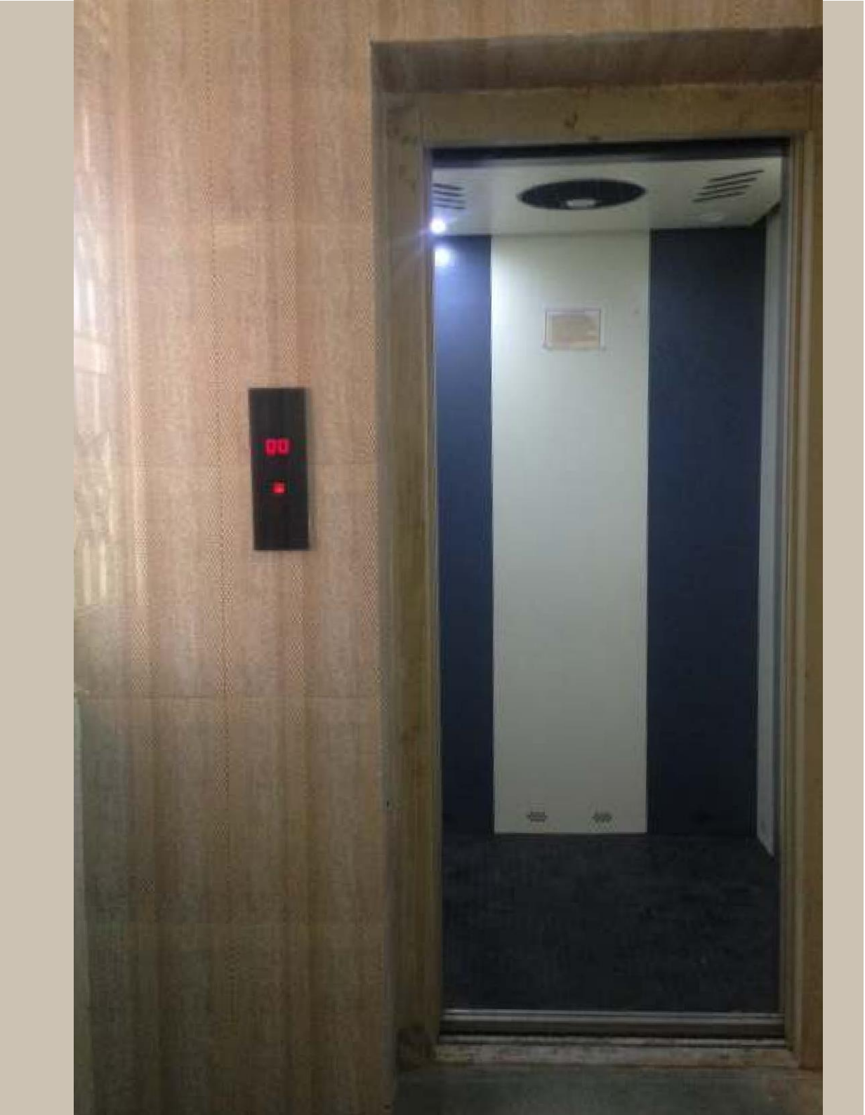
Elevator Facility at Hélène de Chappotin Block