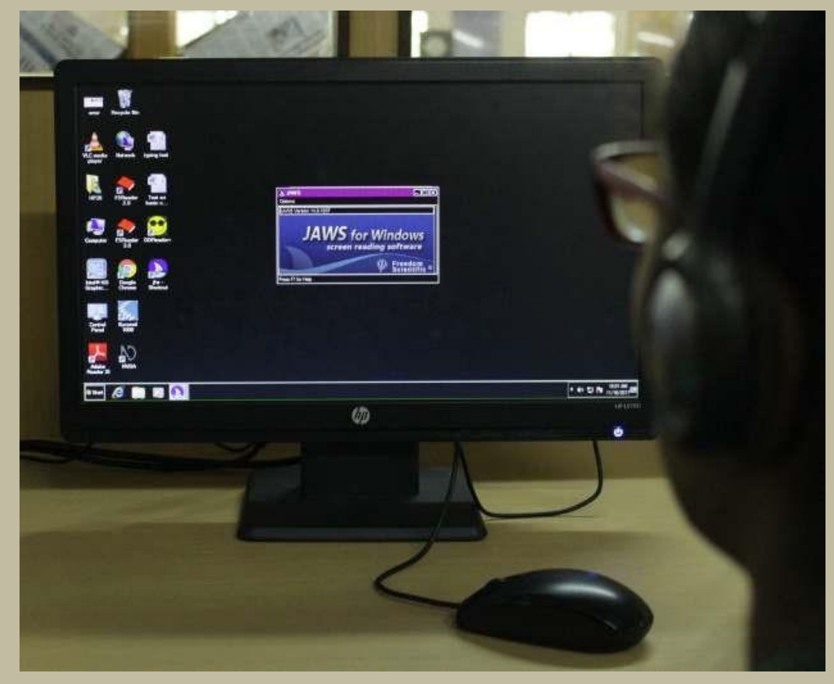
Special Software (JAWS) and Computer Facility for Visually Challenged Students at the College Library