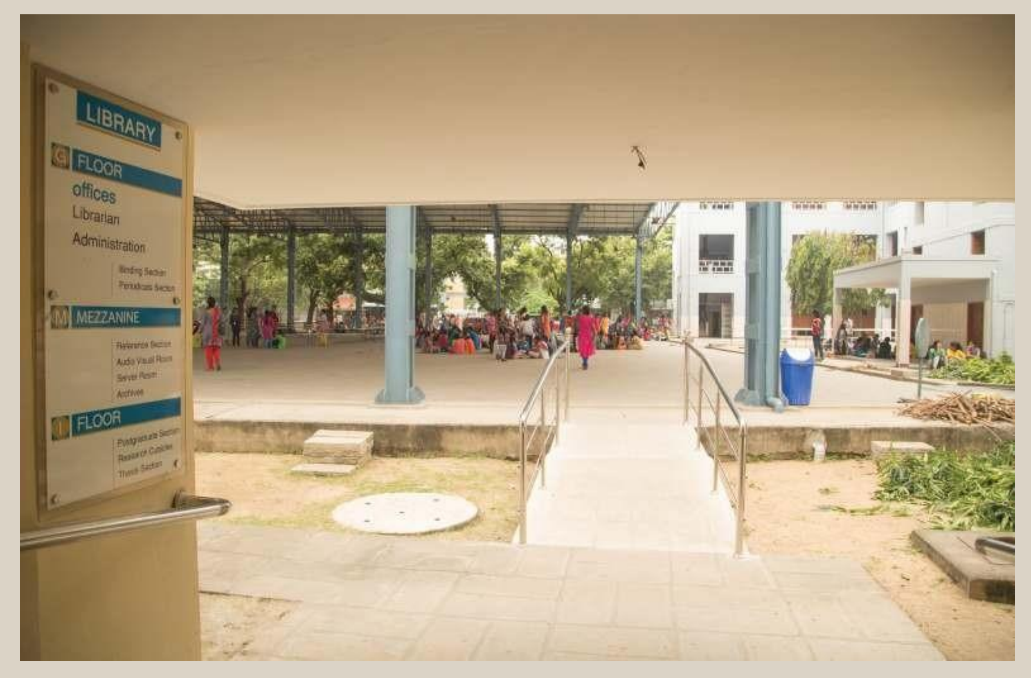
Ramp Facility to Access the College Library from the OAT