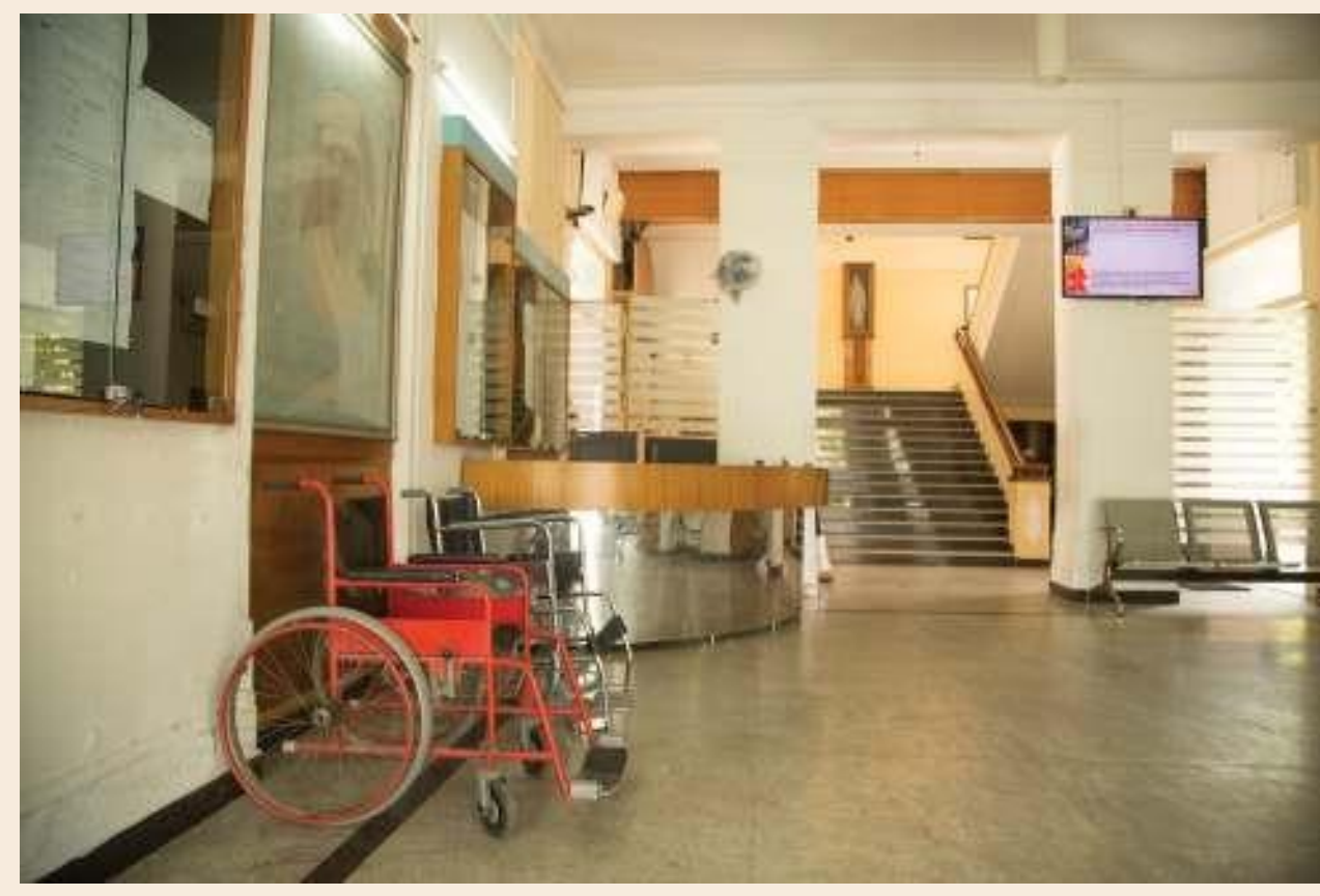
Elevator and Wheelchair Facility at Main Block