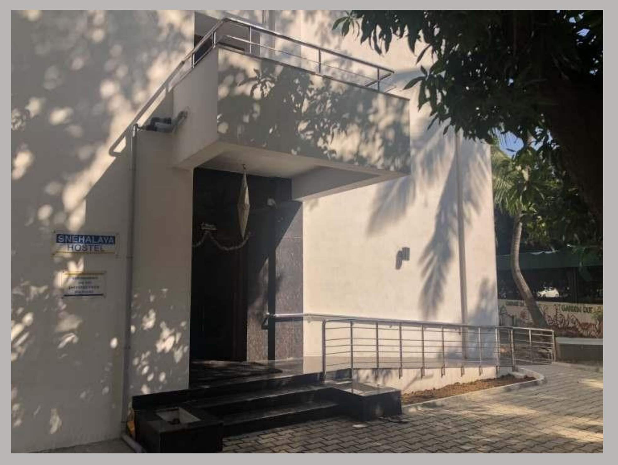
Ramp Facility at Snehalaya Hostel